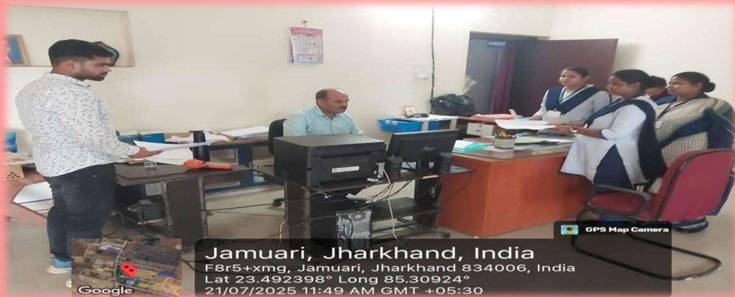
Jamuari, Jharkhand, India F8r5+xmg, Jamuari, Jharkhand 834006, India Lat 23.492398° Long 85.30924° 21/07/2025 11:49 AM GMT +05:30