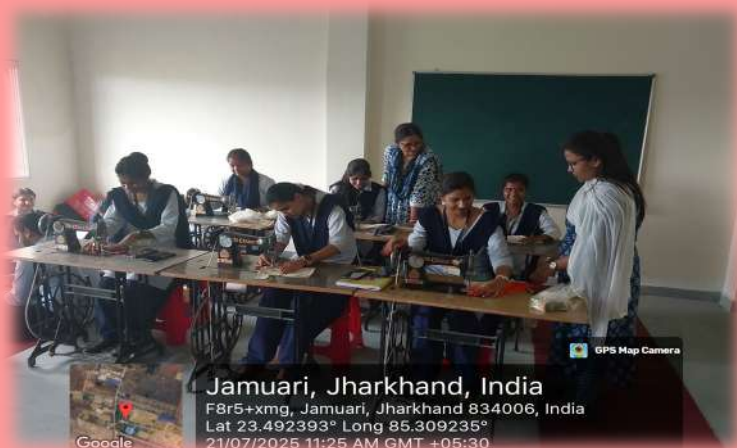
Jamuari, Jharkhand, India F8r5+xmg, Jamuari, Jharkhand 834006, India Lat 23.492393° Long 85.309235° 21/07/2025 11:25 AM GMT +05:30