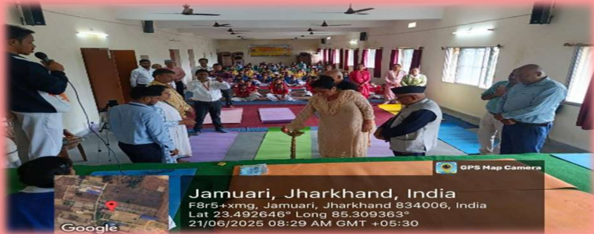
June 21, 2025