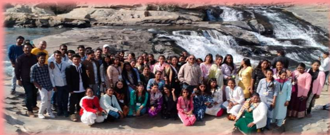
January 18, 2025 Educational Picnic at Pandu Pudding Pandu Pudding