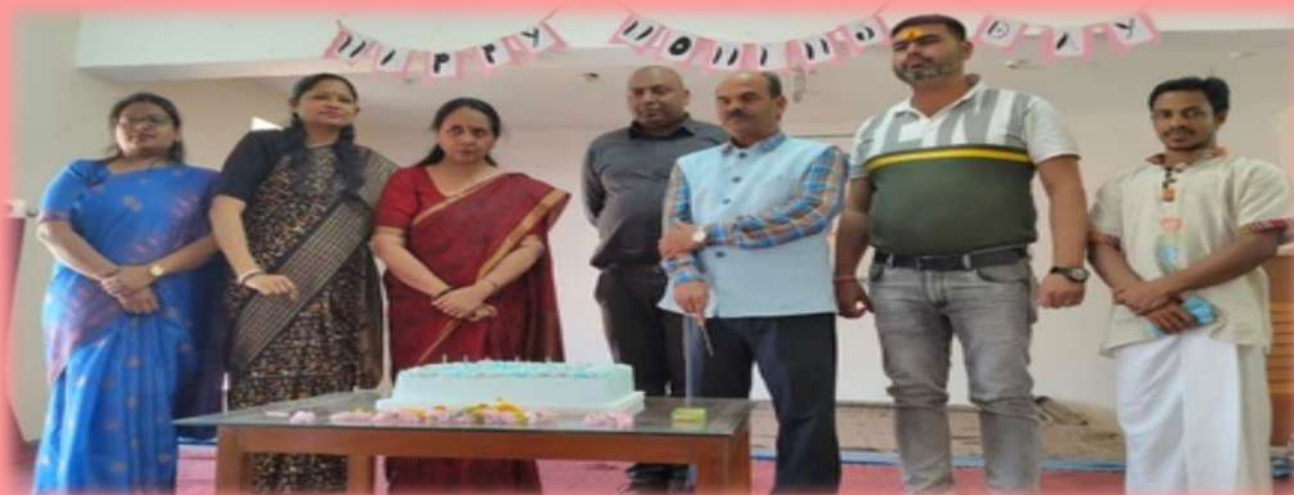
March 8, 2025