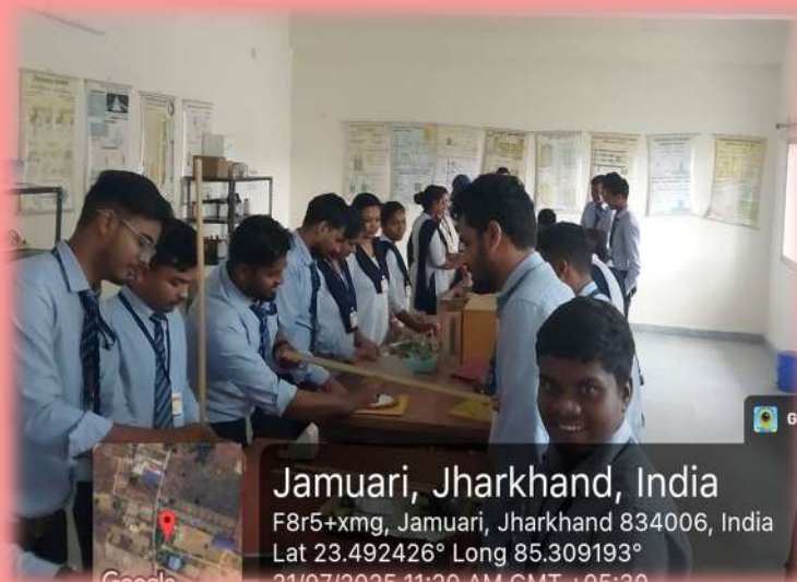
Jamuari, Jharkhand, India F8r5+xmg, Jamuari, Jharkhand 834006, India Lat 23.492426° Long 85.309193° 21/07/2025 11:20 AM GMT +05:30