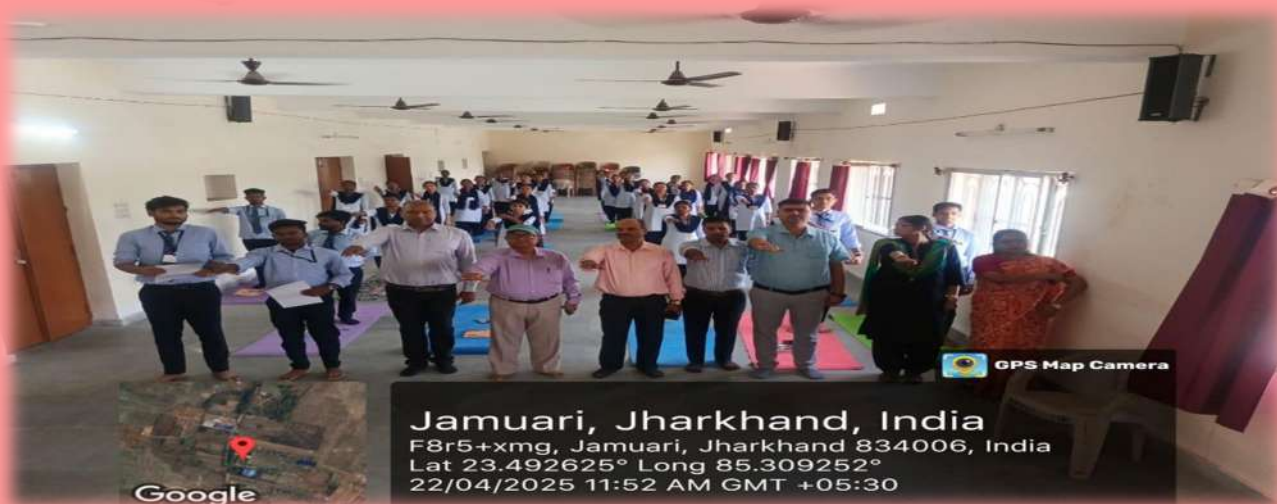
April 22, 2025