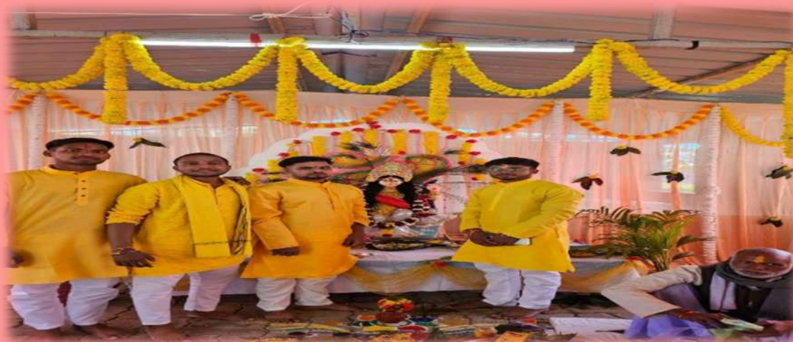
February 3, 2025 Saraswati Puja Celebration School Campus