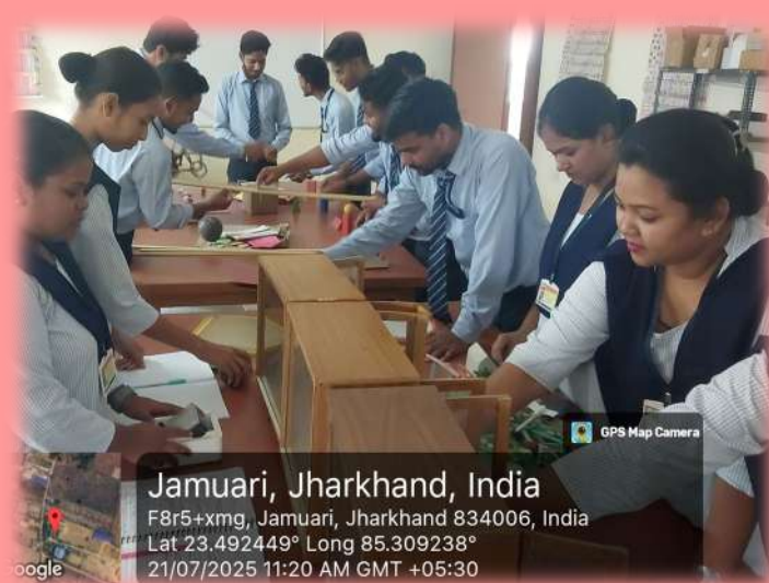
Jamuari, Jharkhand, India F8r5+xmg, Jamuari, Jharkhand 834006, India Lat 23.492449° Long 85.309238° 21/07/2025 11:20 AM GMT +05:30