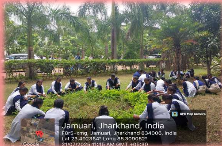
Jamuari, Jharkhand, India F8r5+xmg, Jamuari, Jharkhand 834006, India Lat 23.492364° Long 85.309052° 21/07/2025 11:45 AM GMT +05:30