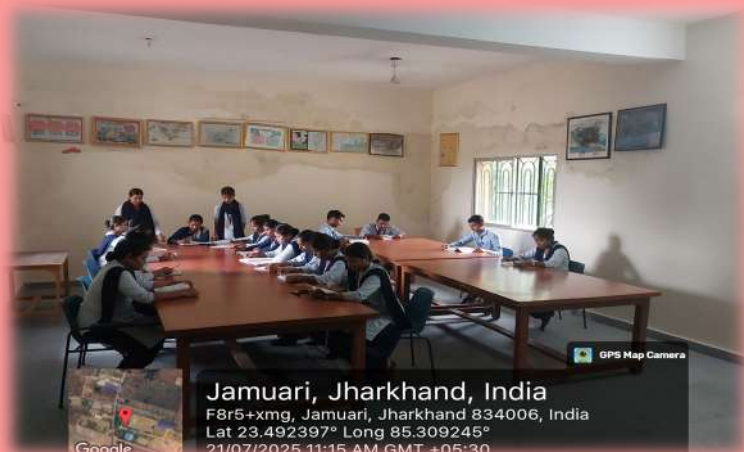
Jamuari, Jharkhand, India F8r5+xmg, Jamuari, Jharkhand 834006, India Lat 23.492397° Long 85.309245° 21/07/2025 11:15 AM GMT +05:30