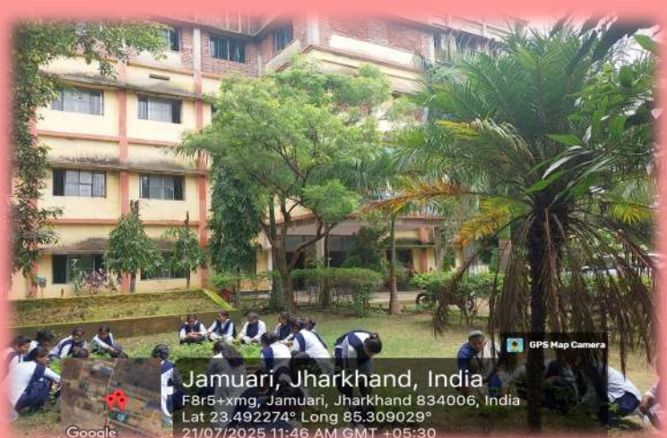
Jamuari, Jharkhand, India F8r5+xmg, Jamuari, Jharkhand 834006, India Lat 23.492274° Long 85.309029° 21/07/2025 11:46 AM GMT +05:30