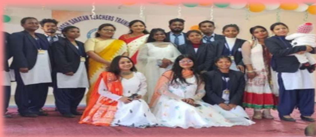
January 26, 2025 Republic Day Cultural Program College Campus