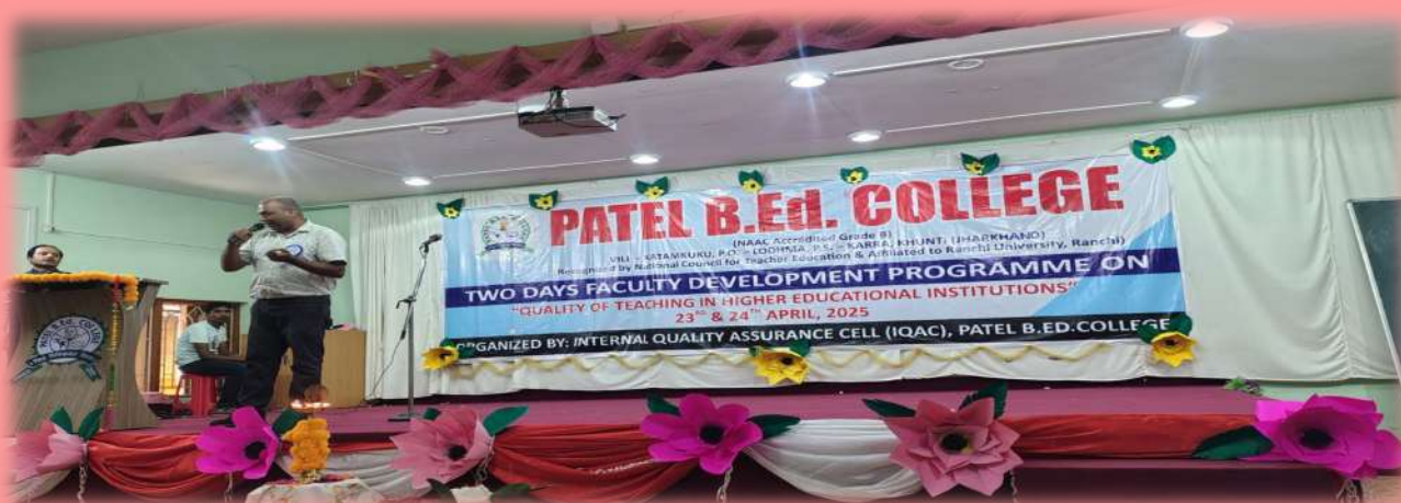
April 23, 2025