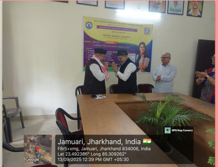
Jamuari, Jharkhand, India 🇮🇳 F8r5+xmg, Jamuari, Jharkhand 834006, India Lat 23.492386° Long 85.309262° 13/09/2025 12:39 PM GMT +05:30