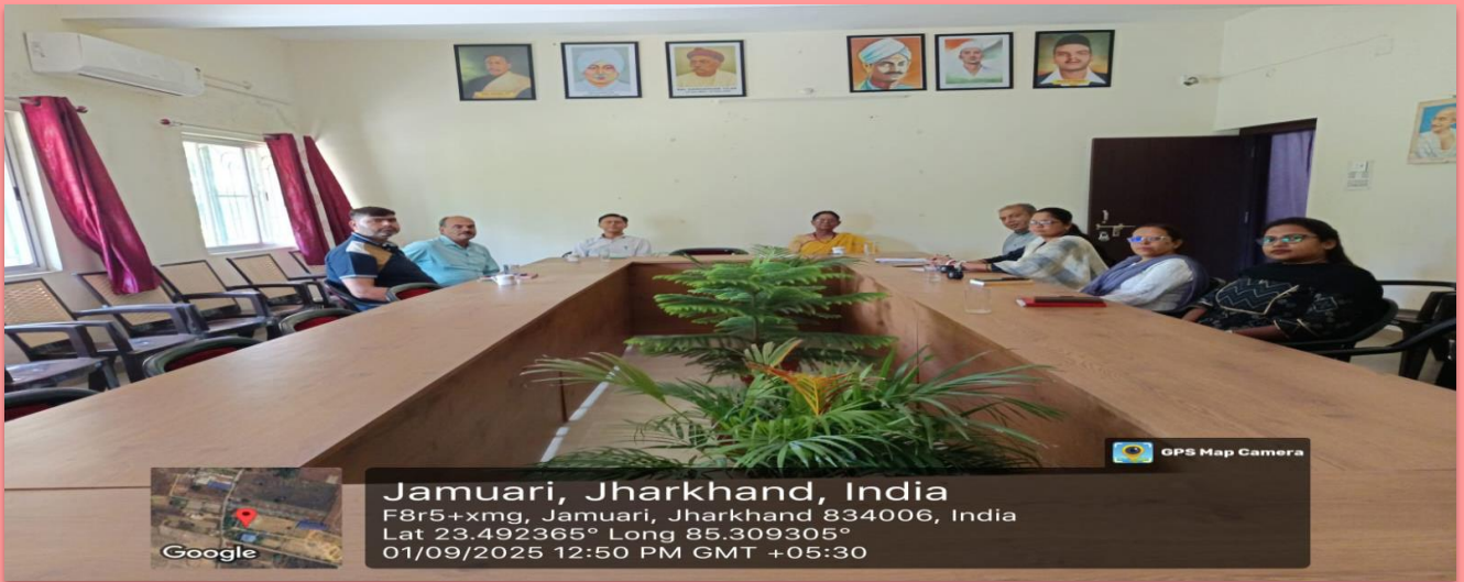
Date: 01 st Sept'2025