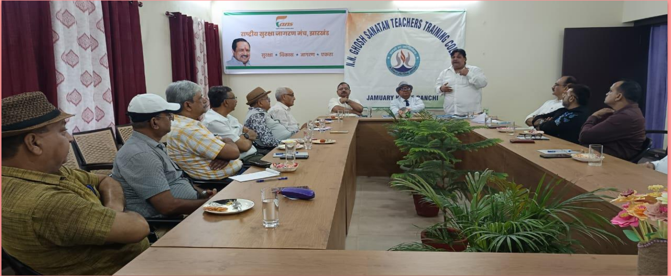
Date: 21 st Aug'2025 FORUM for Awareness of National Security (F. A. N. S.) AGM Meeting College Campus