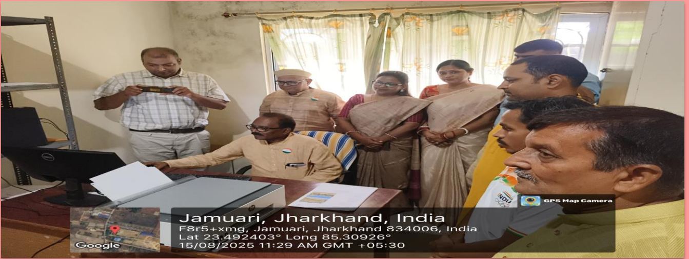
Date: 15 th Aug'2025