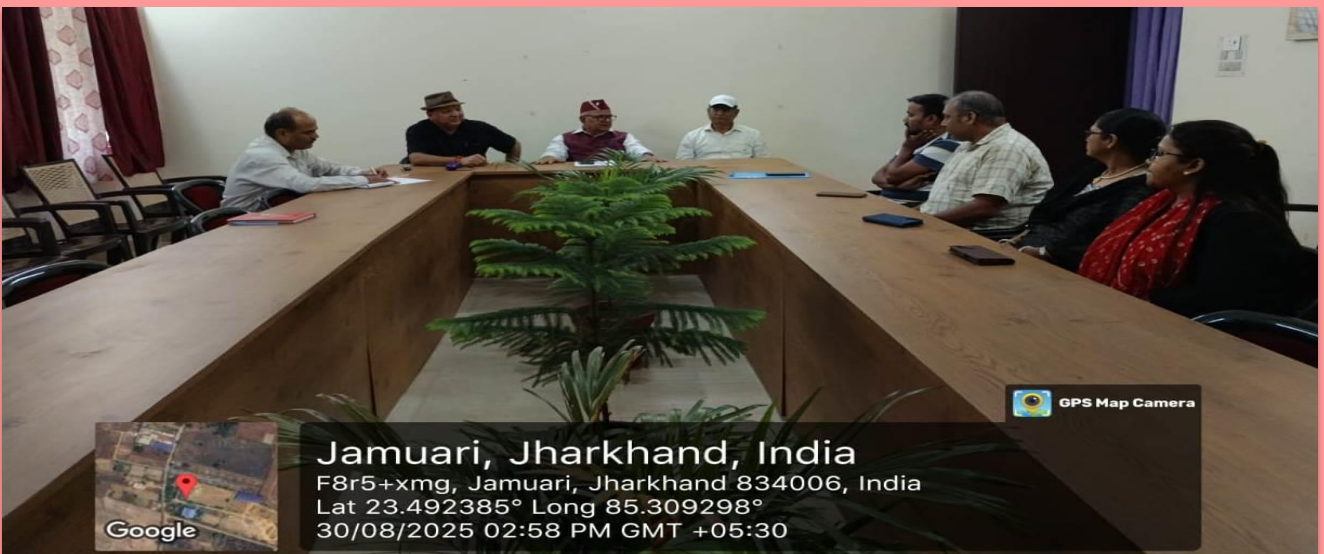
Date: 30th Aug'2025