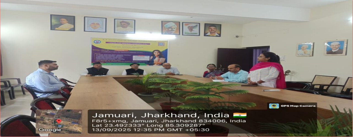
Jamuari, Jharkhand, India 🇮🇳 F8r5+xmg, Jamuari, Jharkhand 834006, India Lat 23.492333° Long 85.309287° 13/09/2025 12:35 PM GMT +05:30