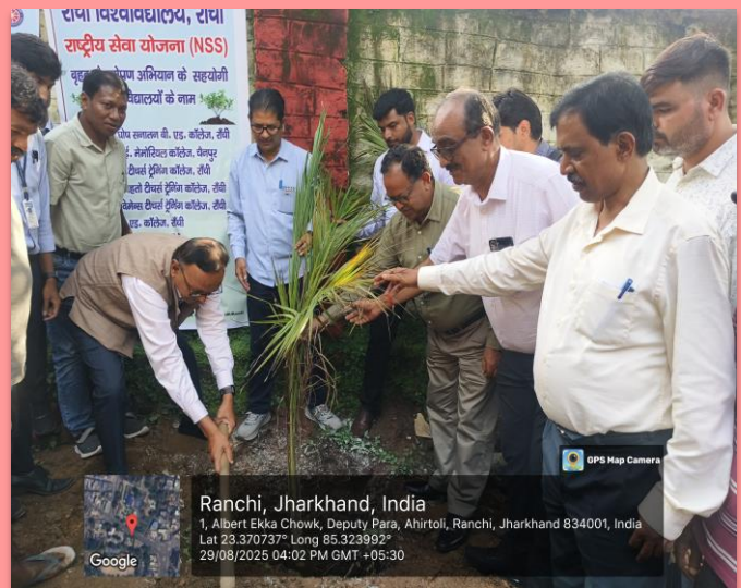
Date: 29th Aug'2025