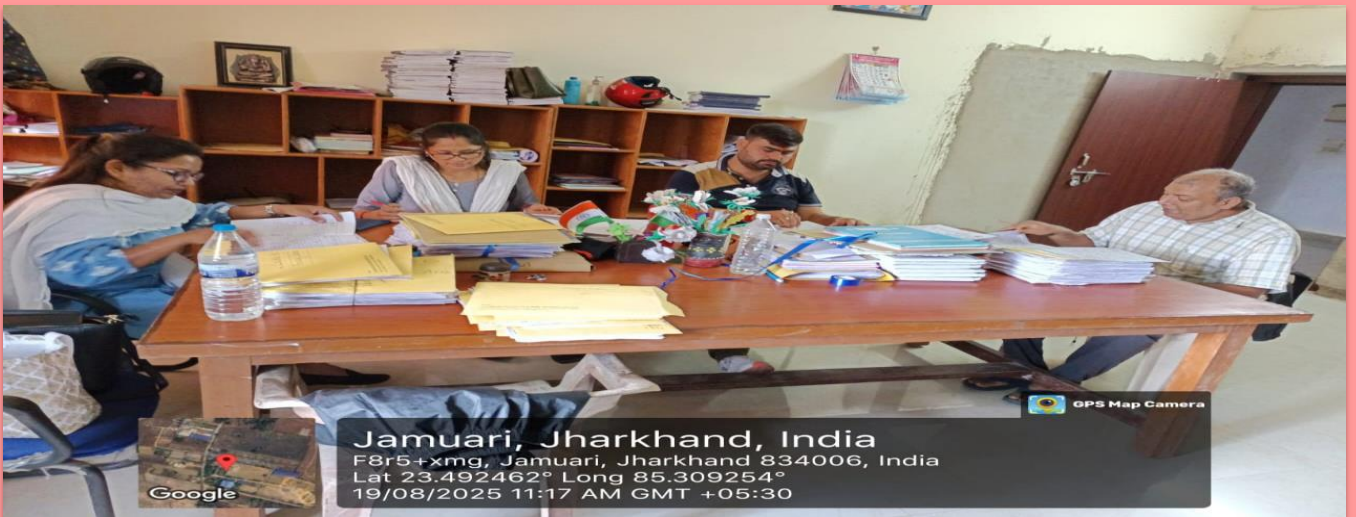
Date: 19 th Aug'2025