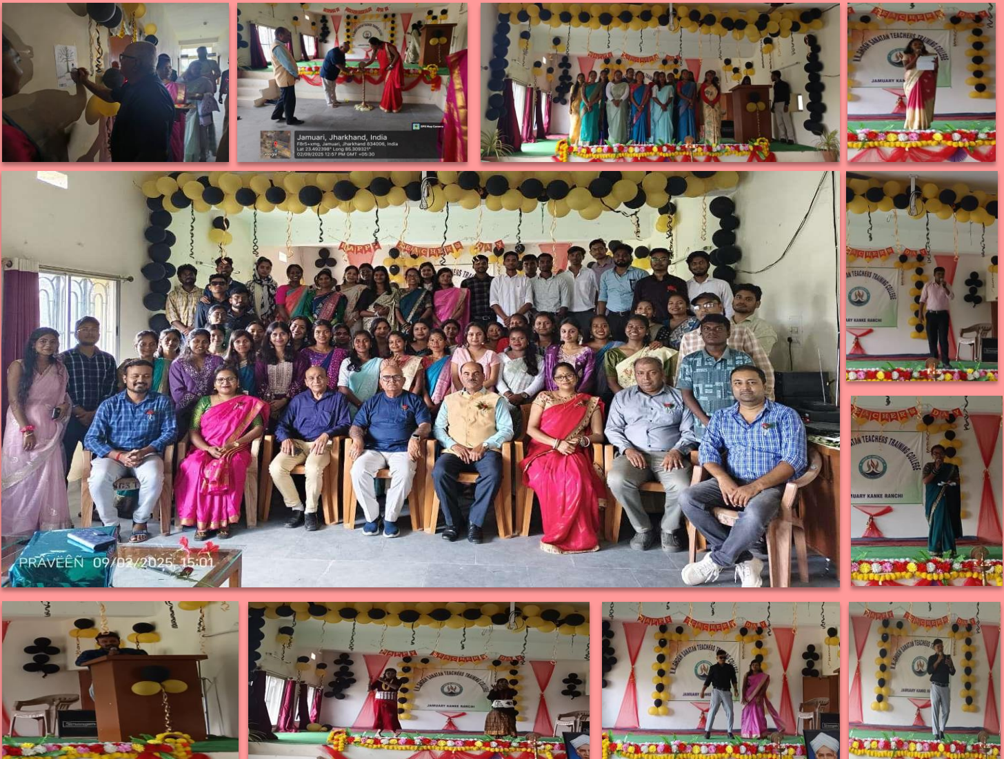
Date: 02nd Sept'2025