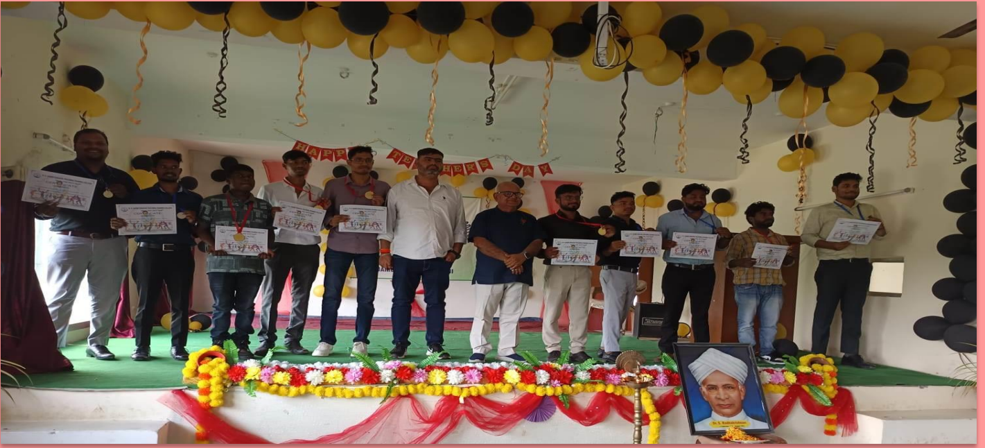
Date: 02nd Sept'2025