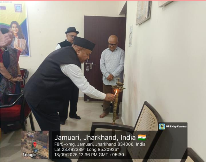
Jamuari, Jharkhand, India 🇮🇳 F8r5+xmg, Jamuari, Jharkhand 834006, India Lat 23.492389° Long 85.30926° 13/09/2025 12:36 PM GMT +05:30